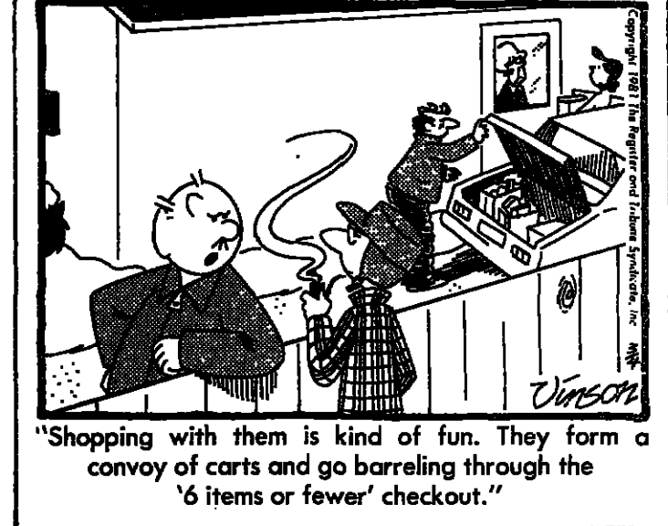
"Shopping with them is kind of fun. They form a convoy of carts and go barreling through the '6 items or fewer' checkout."